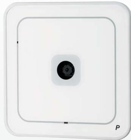
GGM CAMW08 (WI-FI)

Digital I/O for External Sensor and Alarm