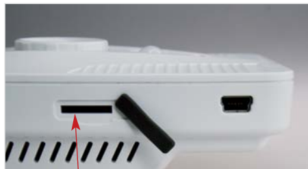
Card micro SD