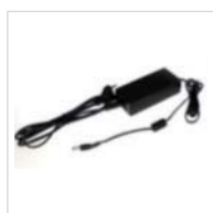
EXTERNAL POWER SUPPLY