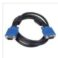
VGA CABLE (1,5M)